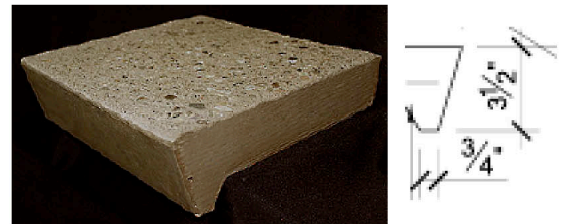
Profile: Semi Closed-Riser Tread. Meets Hawaii code to reject 4" sphere passage.

Bottom left: Kona Brown. Lwr right: Cafe Brown.