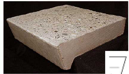
Profile of Tread

These Semi Closed-Riser Treads by STEPSTONE Inc meet most code requirements for a rejection of 4" sphere between treads. (these allow only 3.5")