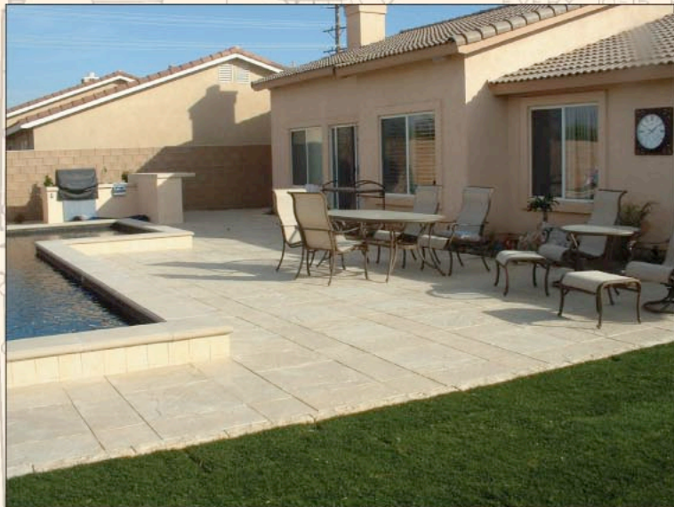
Sand Set, Sonorastone ® Pavers and Borderstone ™