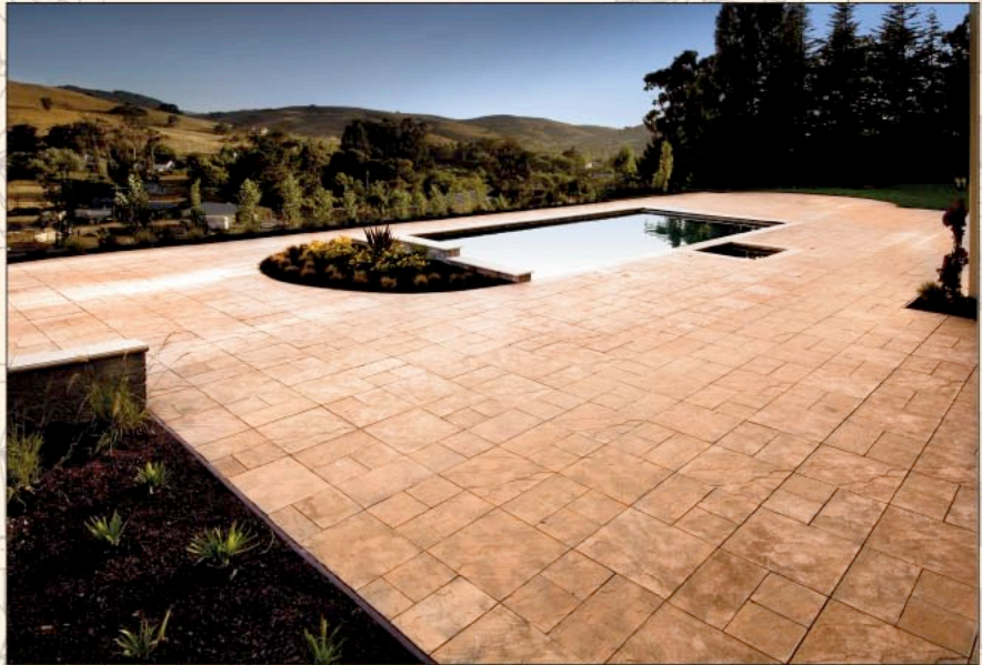
Beautiful Sonorastone ® Pavers in Tuscan Amber

...are Stepstone, Inc.'s spin on stone. Cast in our traditional methods and made of hardrock concrete, Sonorastone ® & Borderstone ™ truly have the look and feel of natural stone. Available in seven stunning variegated colors: Kahlua, Terra, Desert, Tuscan Amber, Wheat, Sterling Gray and Agave Verde.