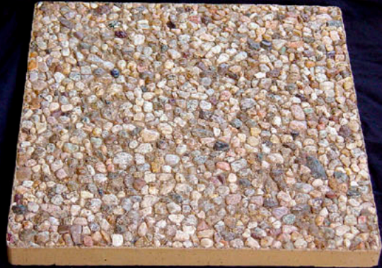
11 3/4" X 11 3/4" X 1" Almond color

Typically 1" X 12 X 12 for landings, which weigh 11#. They are typically mortar-set to concrete board or waterproofed plywood. They're walkable with bare feet, yet anti-slip. Normal maintenance would be once or twice yearly, medium power wash.