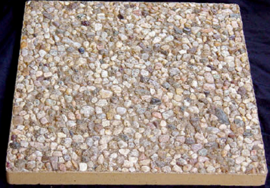
11 3/4" X 11 3/4" X 1" Hawaiian Sand color

Specs: 5,000 PSI Hardrock Concrete. Embedded with Del Rio exposed aggregate from our quarry in California. (No epoxy!) Stain repellent sealer is factory applied, with a 5 year life expectancy. Typically 1" X 12 X 12, weighing 11#. They're walkable with bare feet, yet anti-slip. Alternate aggregate surface is available not exposing the aggregate as much, making the concrete color more prominent, which is even easier on bare feet. Normal maintenance would be once or twice yearly medium power wash.