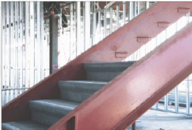
Jobsite installation of Stepstreads

VISIBILITY STRIPE OPTIONAL. Not required in Hawaii. Standard Colors: Granada White & Hawaiian Sand.