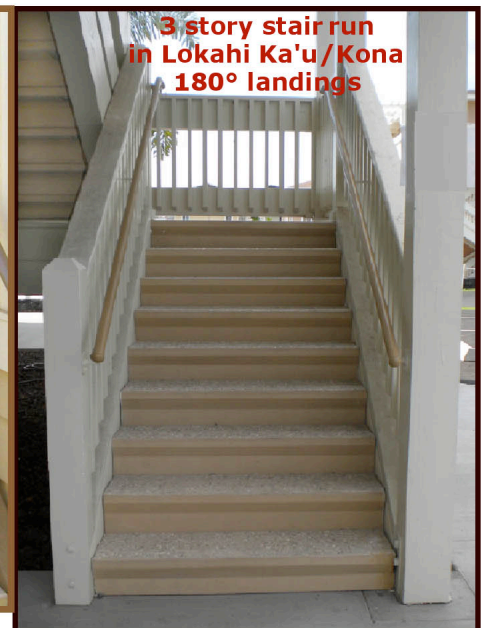
3 story stair run in Lokahi Ka'u/Kona 180° landings