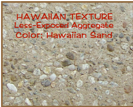
HAWAIIAN TEXTURE Less-Exposed Aggregate Color: Hawaiian Sand