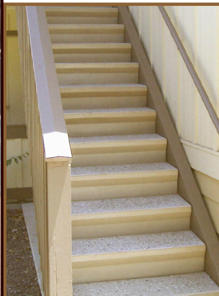
Villas at A'Eloa /Kapolei